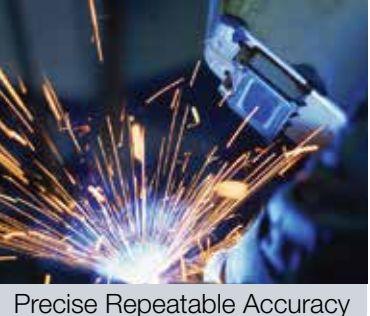
Cut, Bend, Punch, Form, Weld, Paint, Assemble