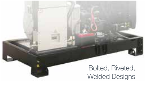
Light Duty Frames